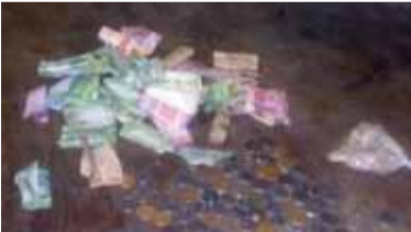
Drugs and cash were seized.