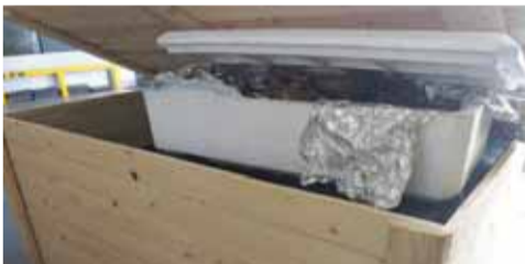
The lion bones were found hidden inside a crate.